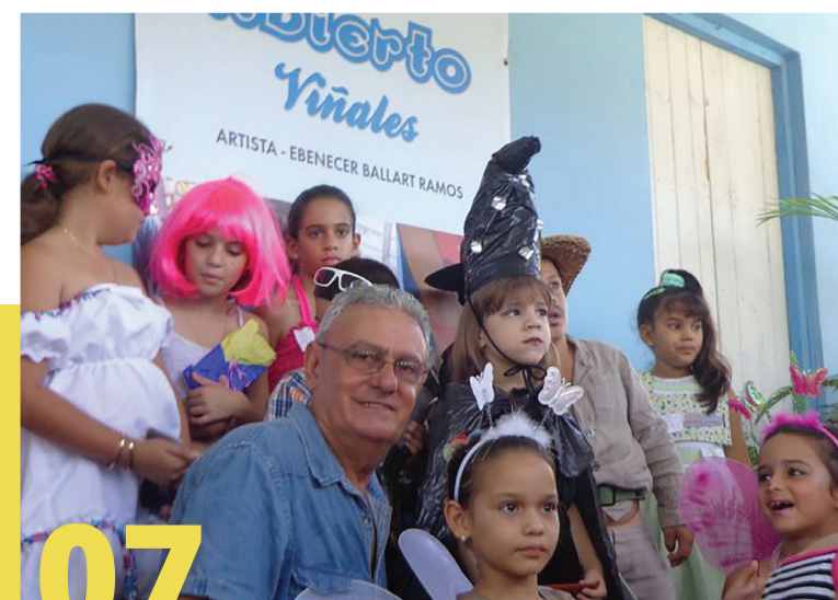
07 SOCIO-CULTURAL PROJECTS Ammonite Dance , proposes from the house of culture, a traditional dance awarded in the 2019 danzón festival, Tel.: 53373887; Ventana al Valle , conducts artistic creation workshops, Tel.: (53) 48695408, and Espacio Abierto develops manual skills in children and youth, Tel.: (53) 48695165.