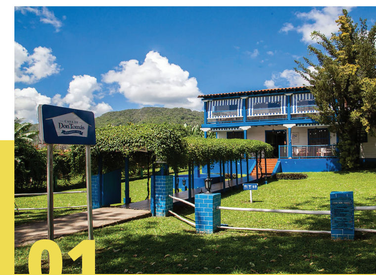
01 RESTAURANT CASA DE DON TOMÁS Taste the "Delicias de Don Tomás" which is a paella with ingredients from land and sea, accompanied by the "Trapiche" cocktail, sweeten your day. Tel.: (53) 48796300.