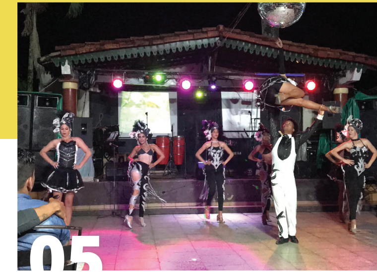
05 POLO MONTAÑEZ CULTURAL CENTER Located in Plaza Viñales, next to the church, where live Cuban music concerts are held. Tel.: (53) 48796164.