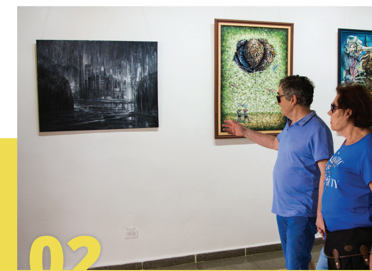
02 VALLE SOY ART GALLERY Here the works of local artists are promoted and commercialized. Tel.: (53) 48793200