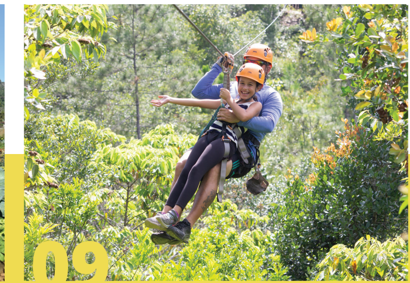
09 CANOPY From the heights, you can observe amazing landscapes of the Penitencia Valley, in a 1100 m long tour. Buy the ticket at the place itself or in travel agencies.