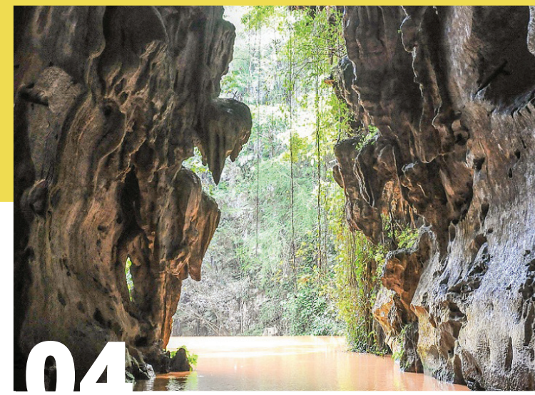
04 CUEVA DEL INDIO «INDIAN CAVE» Located in the valley of San Vicente, you venture to walk through a gallery and navigate a river by boat. Tel.: (53) 48 796280.