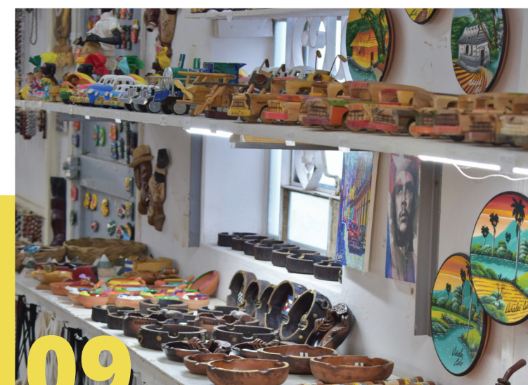
09 CRAFT BAZAAR Head to the open-air handicrafts market where you can buy a souvenir of the region on Salvador Cisneros Street.