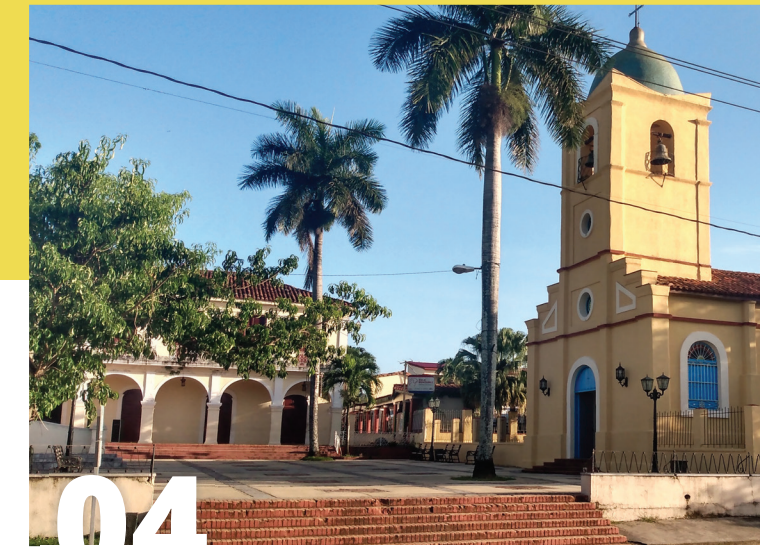
04 VIÑALES MAIN SQUARE It is the epicenter of the Festival of Traditions "Viñales, Valle Vivo" , sponsored by the Regional Office of UNESCO in Latin America and where the locals show their love for music, handicrafts, plastic arts and creative gastronomy.