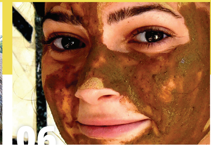
06 RANCHO SAN VICENTE SPA Since 1838, the main incentive to visit Viñales was the mineral-medical waters of the San Vicente valley. Today baths, massages and mud therapy are offered under medical prescription. Tel.: (53) 48796201.