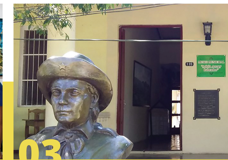
03 ADELA AZCUY MUSEUM It invites you to appreciate a collection of period furniture and information about the history and geology of Viñales. It is an alternative room for art exhibitions. Tel.: (53) 48793395.