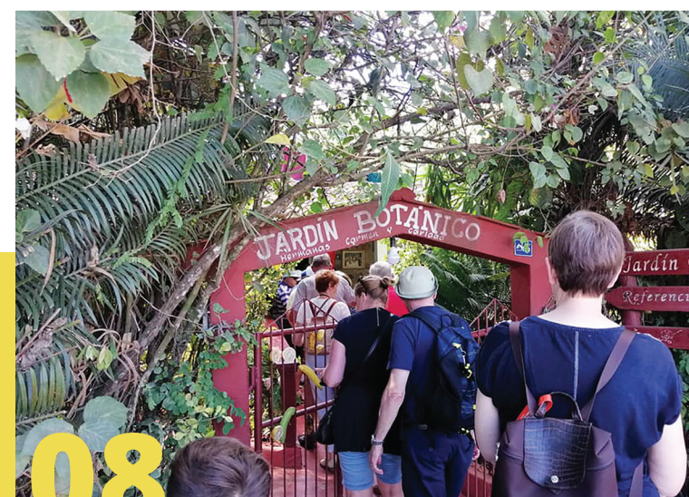
08 CHARITY GARDEN It is like entering an eternal spring where the most beautiful thing is the collection of orchids, tropical plants, ornamental, medicinal and typical trees, Salvador Cisneros Street No. 15. Tel.: 54452207.