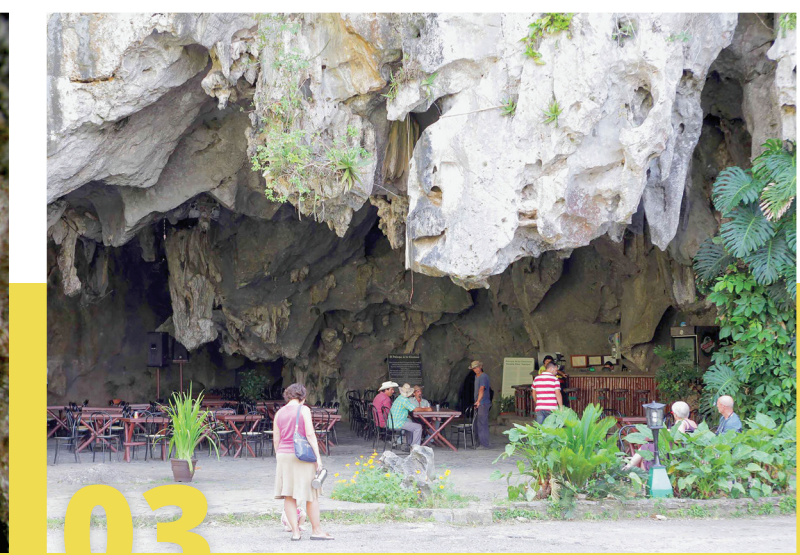
03 JOSÉ MIGUEL CAVE Also known as Palenque de los Cimarrones, it invites you to learn about Afro-Cuban culture and, at night, to dance to local music. Tel.: (53) 48 796290.