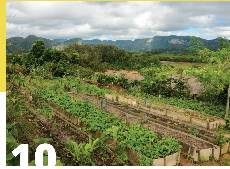
10 AGRO ECOLOGICAL FARM EL PARAÍSO They combine fine herbs to elaborate the anti-stress cocktail, exquisite to relax, in addition to its excellent Cuban dishes. Road to the cemetery Km 1/2. Tel.: 58188581.