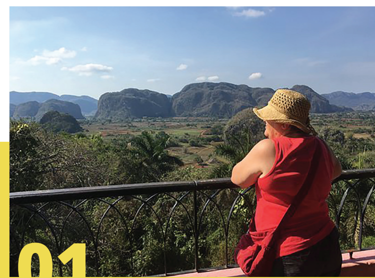
01 LOS JAZMINES VIEWPOINT From the Mirador Los Jazmines, you can enjoy one of the best pictures of the Viñales Valley, declared by UNESCO as a Cultural Landscape of Humanity. To get to know the National Park, you can take excursions by buggy, bicycle, horseback, or through guided trails, available at the Visitor's Center or travel agencies.