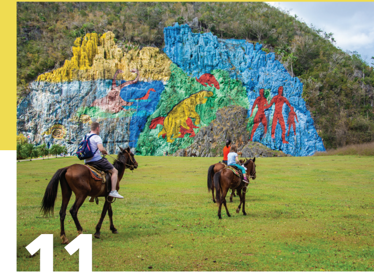
11 PREHISTORIC MURAL It is one of the largest mural paintings in Cuba created on the wall of a mogote that describes the biogeological evolution of the area. It increased its fame with the fall of a meteorite on February 2, 2019. Tel.: (53) 48796260.