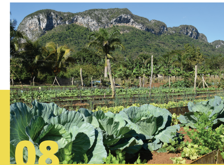
08 LA CUEVA AGRO ECOLOGICAL FARM It has a cultivation house for the production of vegetables and harvests the guayabita del pinar, a fruit used to make the region's signature drink. Km 28 to Puerto Esperanza. Tel.: (53) 53365406