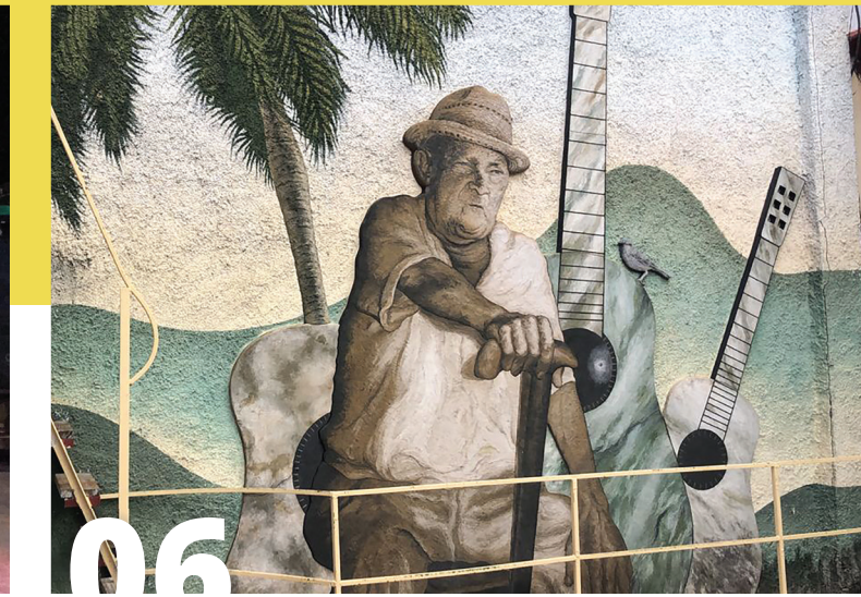
06 PATIO DEL DECIMISTA CULTURAL CENTER To dance to live music and listen to the "décima campesina", located at Salvador Cisneros No. 241.