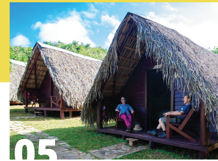
05 SAN VICENTE FARM It has a bird watching trail and an exquisite restaurant. For an overnight stay in nature, you can stay at the Casa campesina and bohíos. Tel.: (53) 48796110.