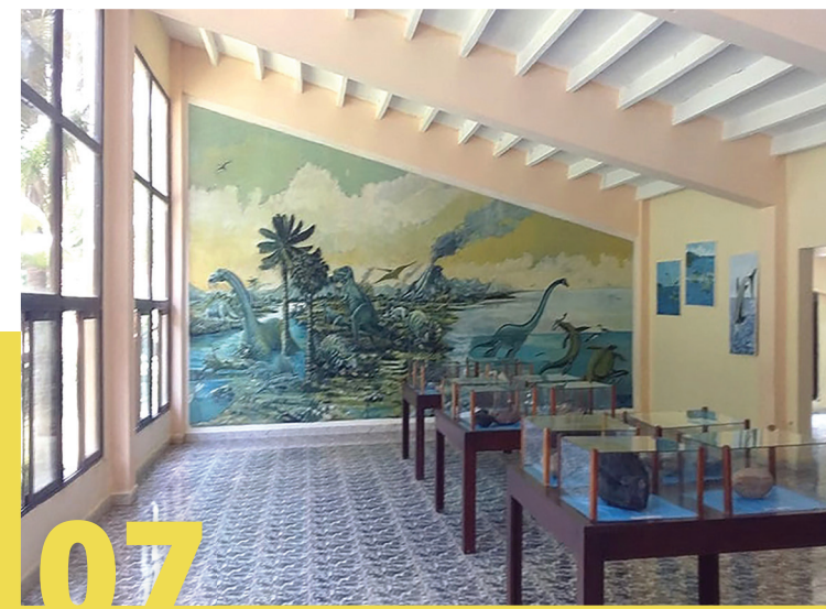
07 EL JURÁSICO PALEONTOLOGICAL MUSEUM Learn about the geology of the area through fossils of ammonites, fish, dinosaur shales and marine reptiles on limestone from 170 million years ago. Visit it at Dos Hermanas Campground. Tel.: (53) 48793223.