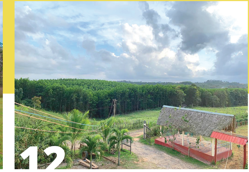
12 EL OLIVO AGRO ECOLOGICAL FARM They grow the products they offer in their restaurant. The most successful of all is the goat cheese, which has won several awards for the best artisan producer in Cuba. Road to the cemetery Km 1. Tel.: (53) 54407173